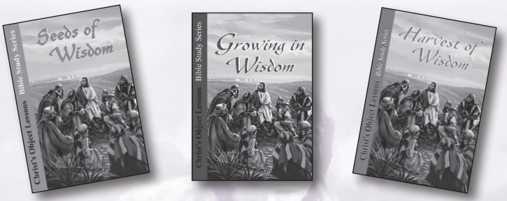
Christ's Object Lessons Bible Study Series

In teaching with parables, Christ's purpose was to use nature as a medium to teach the spiritual and connect us with the truths of His written Word. Seeds of Wisdom, Growing in Wisdom , and Harvest of Wisdom uses the parables of Christ from the classic, Christ's Object Lessons as commentary in a life-changing Bible interactive study series. Since each guide is based on a different set of parables the guides can each stand alone as a study tool or can be done as a series. Some titles available in Spanish.